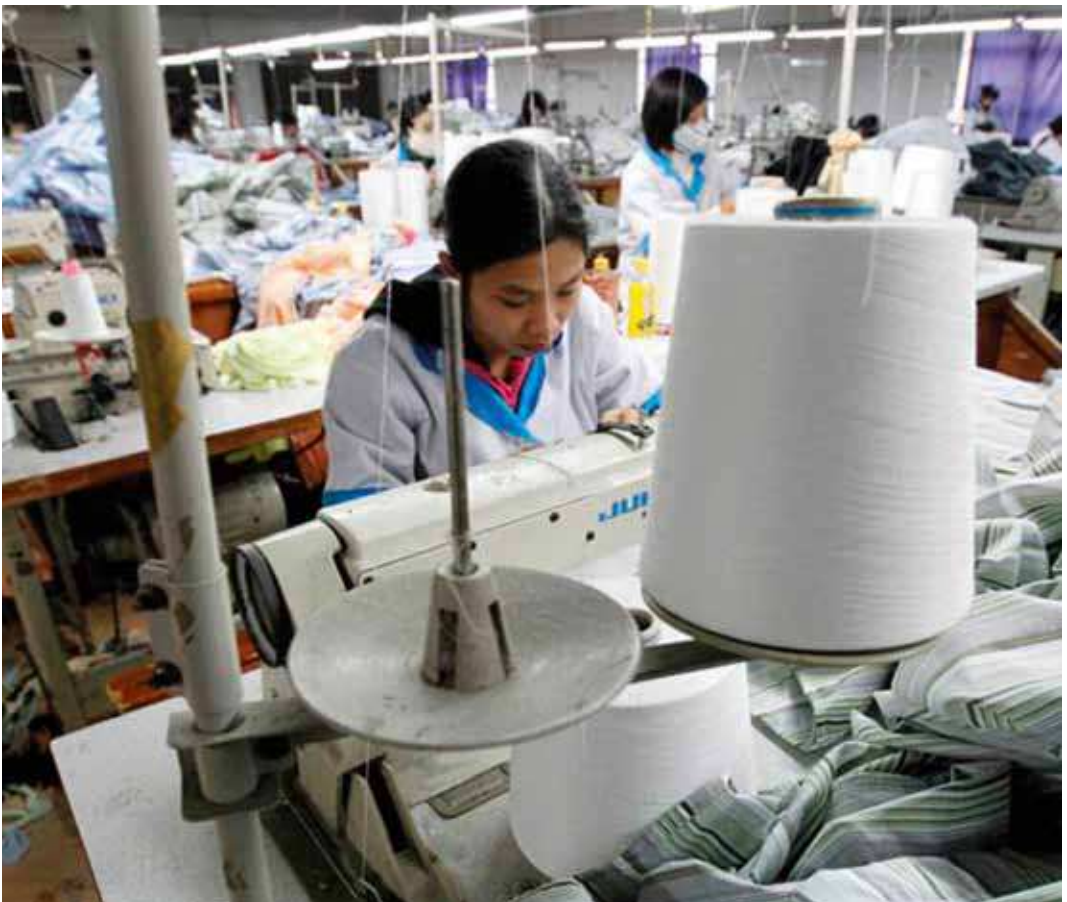
Labourers work at a garment factory south of Hanoi 4 January 2012. Vietnam's export of textiles and garments last year jumped 25% from 2010 to $14.03 billion, making it the biggest export item of the country.

Those changes in Vietnam's foreign policy and strategic outlook have helped mobilise valuable external resources to turn the country into an economic 'rising star'. Its GDP (at official exchange rates) has increased sevenfold since 1985 to US$103 billion in 2010 3 , bringing Vietnam into the ranks of low middle income countries. The relatively robust economic development over the past two decades has helped to reduce the poverty rate from around 60% in the late 1980s to 10.6% in 2011. Those socioeconomic achievements are undoubtedly the most important basis for the VCP's claim to legitimacy for its rule,