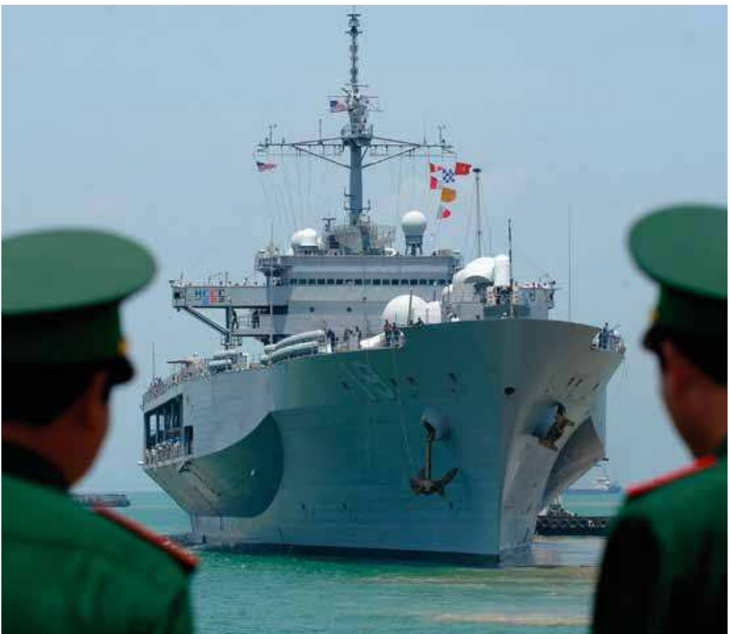
Vietnamese border guards watch the US Seventh Fleet's USS Blue Ridge entering Tien Sa port as Vietnam welcomes the port call of three US naval ships in Danang on 23 April 2012.

However, Vietnam's investment in its naval capabilities is still very modest compared with that of China, its main rival in the South China Sea. In 2011, while China's official military budget was $91.5 billion, Vietnam was reported to allocate only $2.6 billion to defence (about 2.5% of its GDP). Therefore,