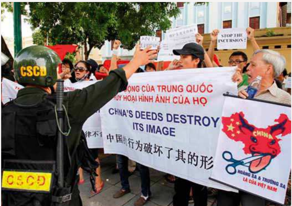
Protesters took to the street in Hanoi for a fifth consecutive Sunday on 3 July 2011 to rally against China's activities in the South China Sea

Meanwhile, China has been emerging as a global superpower. Although its impressive economic development has been praised as