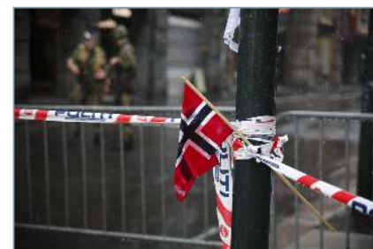
A Norwegian flag tied to a lamp post in Oslo following the 22 July 2011 car bomb

Norway's military involvement in Afghanistan and Libya, the indictment of the radical cleric Mullah Krekar on terror charges, or the printing of cartoons depicting the Prophet Muhammad in a Norwegian newspaper.